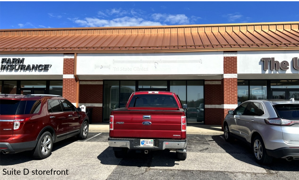
Suite D storefront