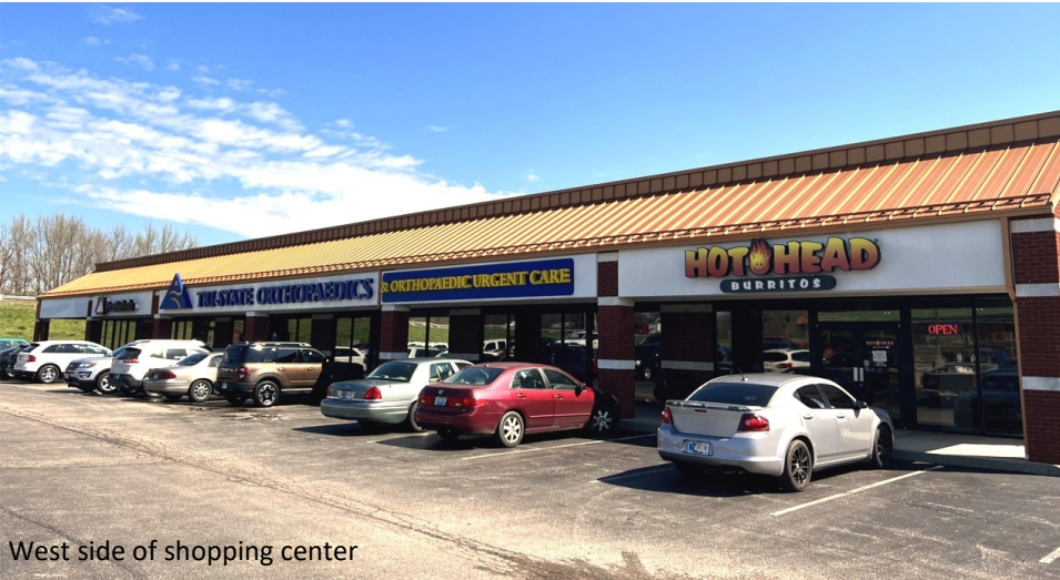
West side of shopping center