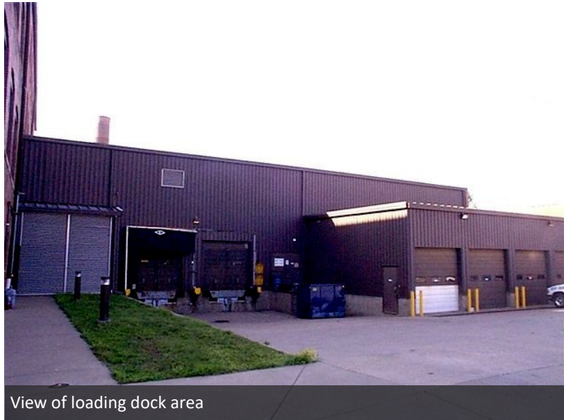
View of loading dock area