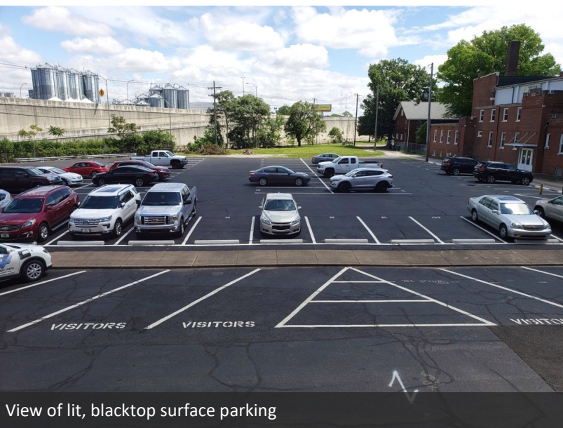
View of lit, blacktop surface parking