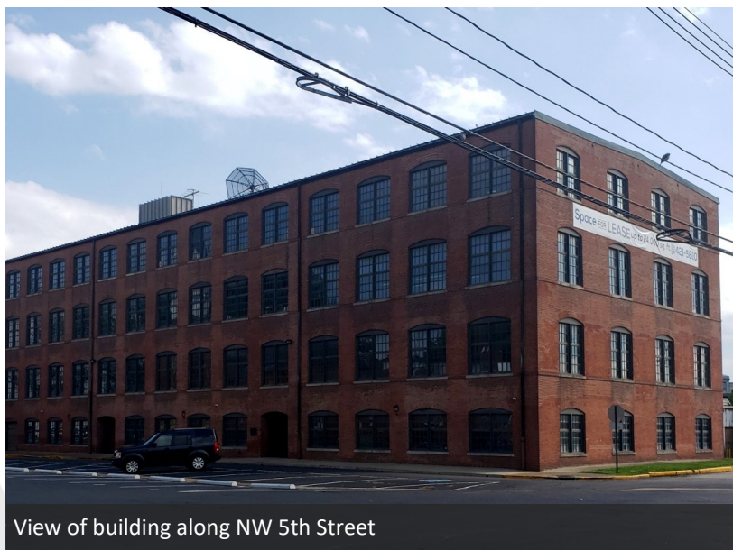
View of building along NW 5th Street

RICHARD CLEMENTS 812.746.8569 rclements@summitrealestate.us